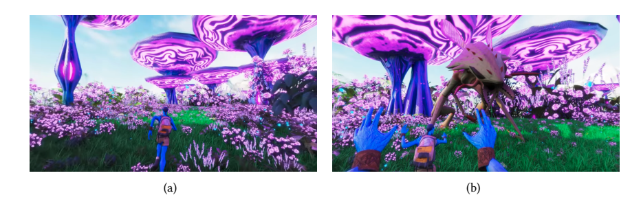
Figure 2: Screenshots from the interview video probe. The photos show (a) the brightly-colored environment in the Avatar world and (b) a large bug that participants encountered.

Beyond Audio Description: Exploring 360° Video Accessibility with BLV Users Through Collaborative Creation